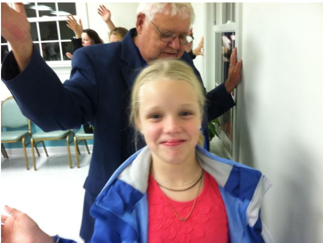
Hands raised in thanks to God and in contact with our building as participants bless our church expansion in a special service on November 27 th .